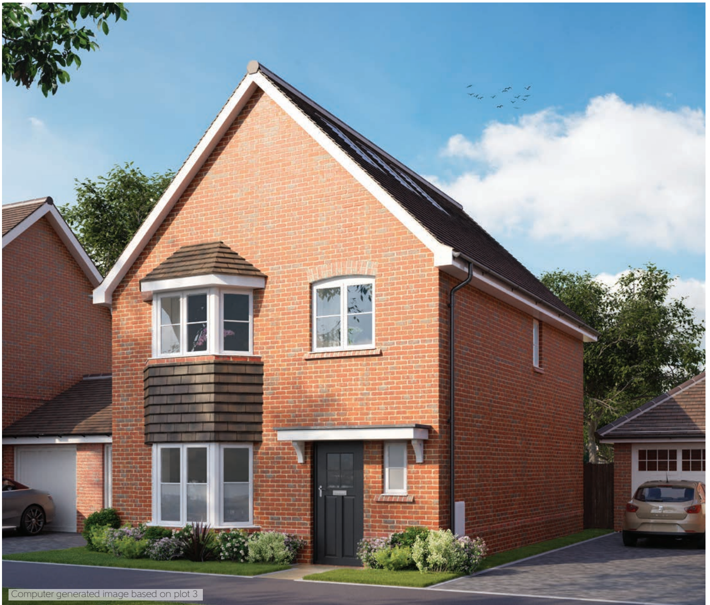
Computer generated image based on plot 3

Wickfields, Barn Road, Longwick, Buckinghamshire HP27 9RW