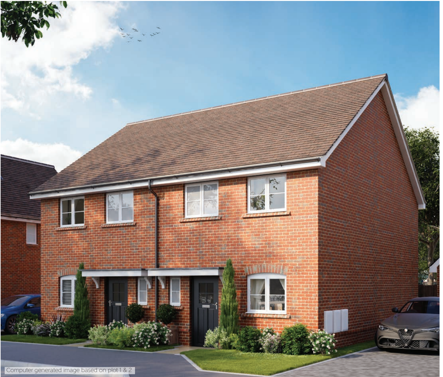
Computer generated image based on plot 1 & 2

Wickfields, Barn Road, Longwick, Buckinghamshire HP27 9RW