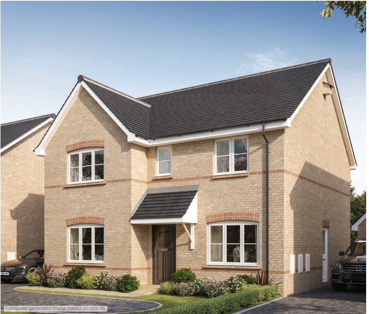
Computer generated image based on plot 36

Wickfields, Barn Road, Longwick, Buckinghamshire HP27 9RW