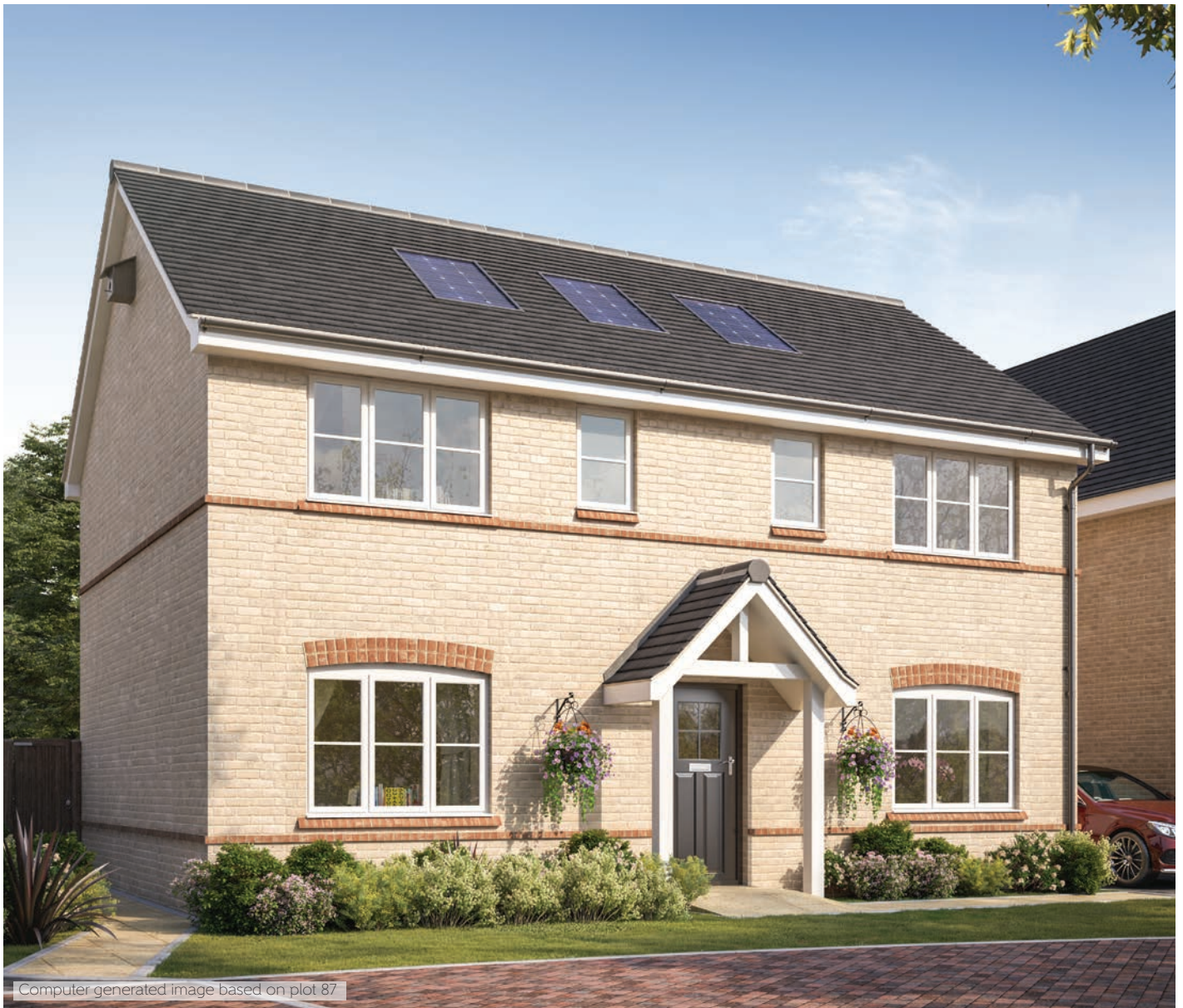
Computer generated image based on plot 87

Wickfields, Barn Road, Longwick, Buckinghamshire HP27 9RW