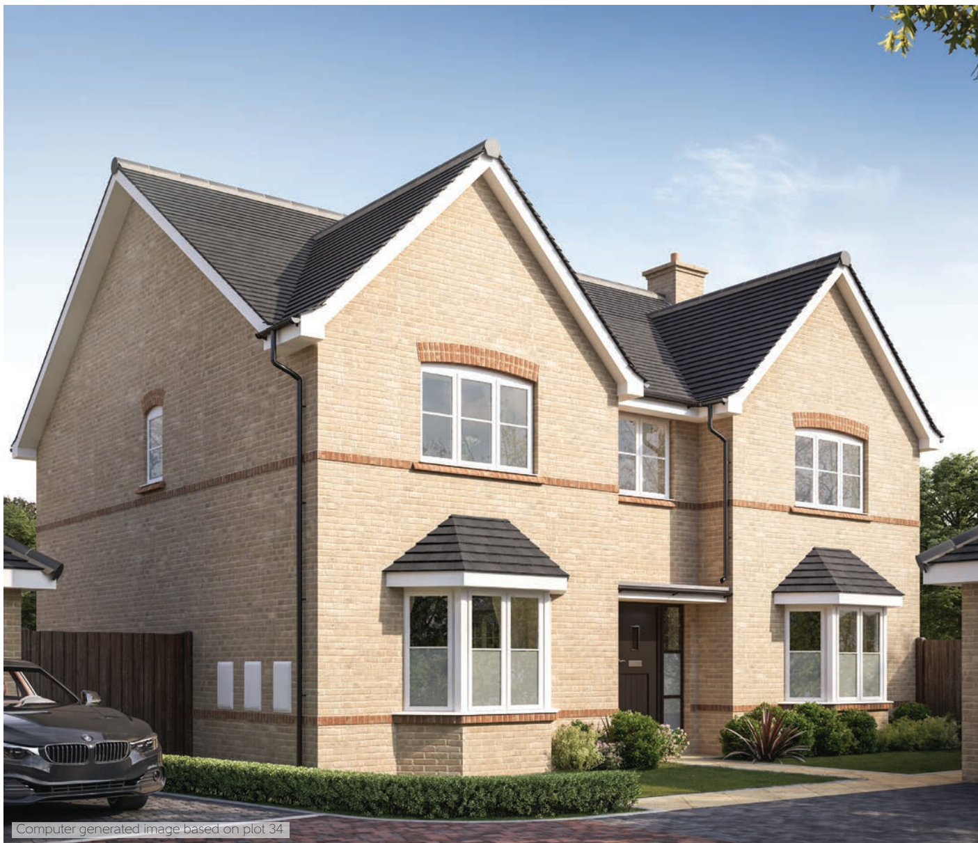
Computer generated image based on plot 34

Wickfields, Barn Road, Longwick HP27 9RW